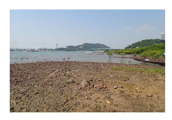
(a) Survey Location at TCB1