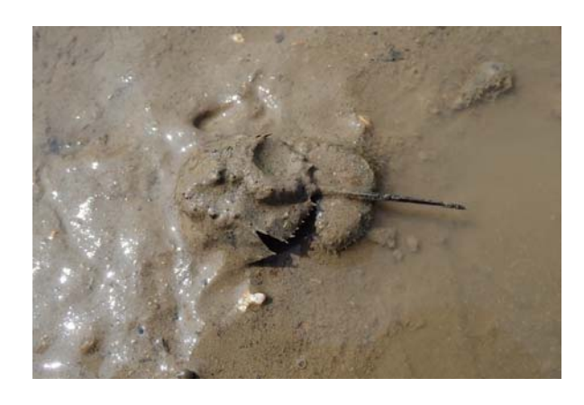
(e) Horseshoe crab Carcinoscorpius rotundicauda recorded at TCB2 during Qualitative Walk-through Survey