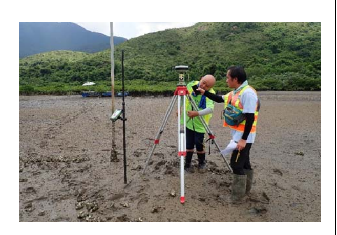
(f) Sedimentation Rate Monitoring