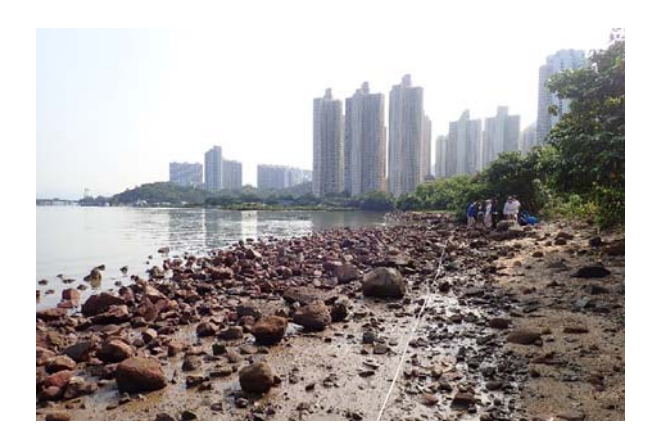
(b) Survey Location at TCB2