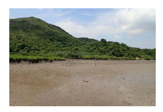
(d) Survey Location at THW